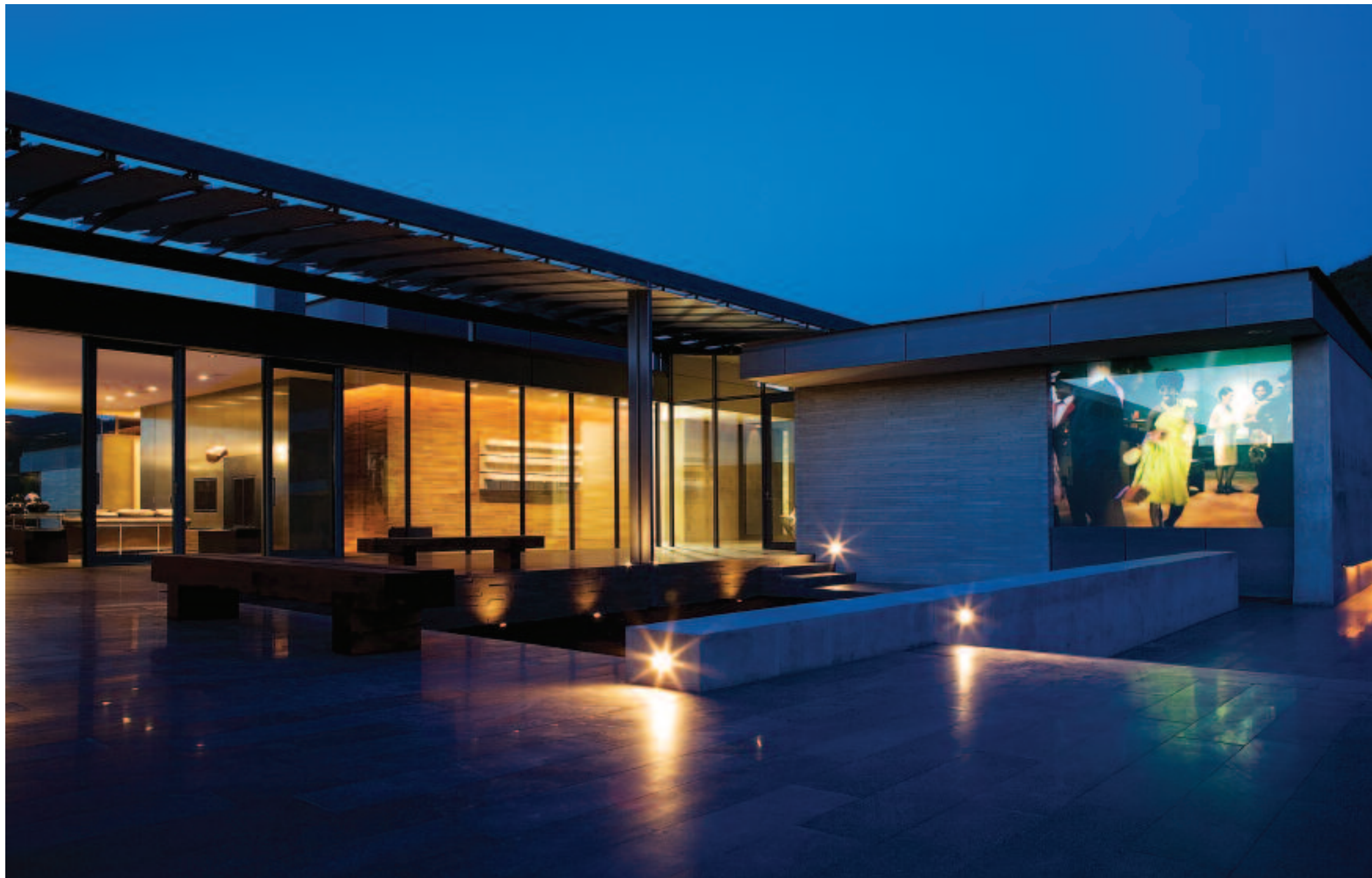
James Turrell's skyspace, open to the heavens and the elements, is an otherworldly retreat in the heart of the home (left). The double staircase leading to the skyspace is mirrored on the far wall by Gerhard Richter's photograph, Nude Descending Staircase (preceding page). The interior's neutral palette, which has a cooling quality that contrasts with bright daylight, acquires a warm, welcoming glow as the sun sets (right). A rear-projection screen designed by Isaac Julien to display the owners' collection of video art encourages outdoor relaxation.