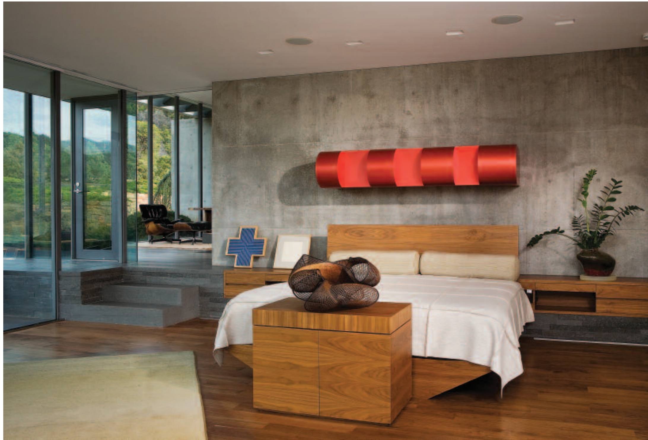
The wall-less, open design flows into the private living areas as well. Teresita Fernández's Untitled , made of glass cubes, adds a subtle play of color above the tub (left). The bedroom's serene spaciousness (right) lets the art stand out: Donald Judd's wall sculpture of red anodized aluminum; Frank Stella's ink on paper, Untitled Blue Cross ; and a Japanese basket sculpture from Tai Gallery in Santa Fe.