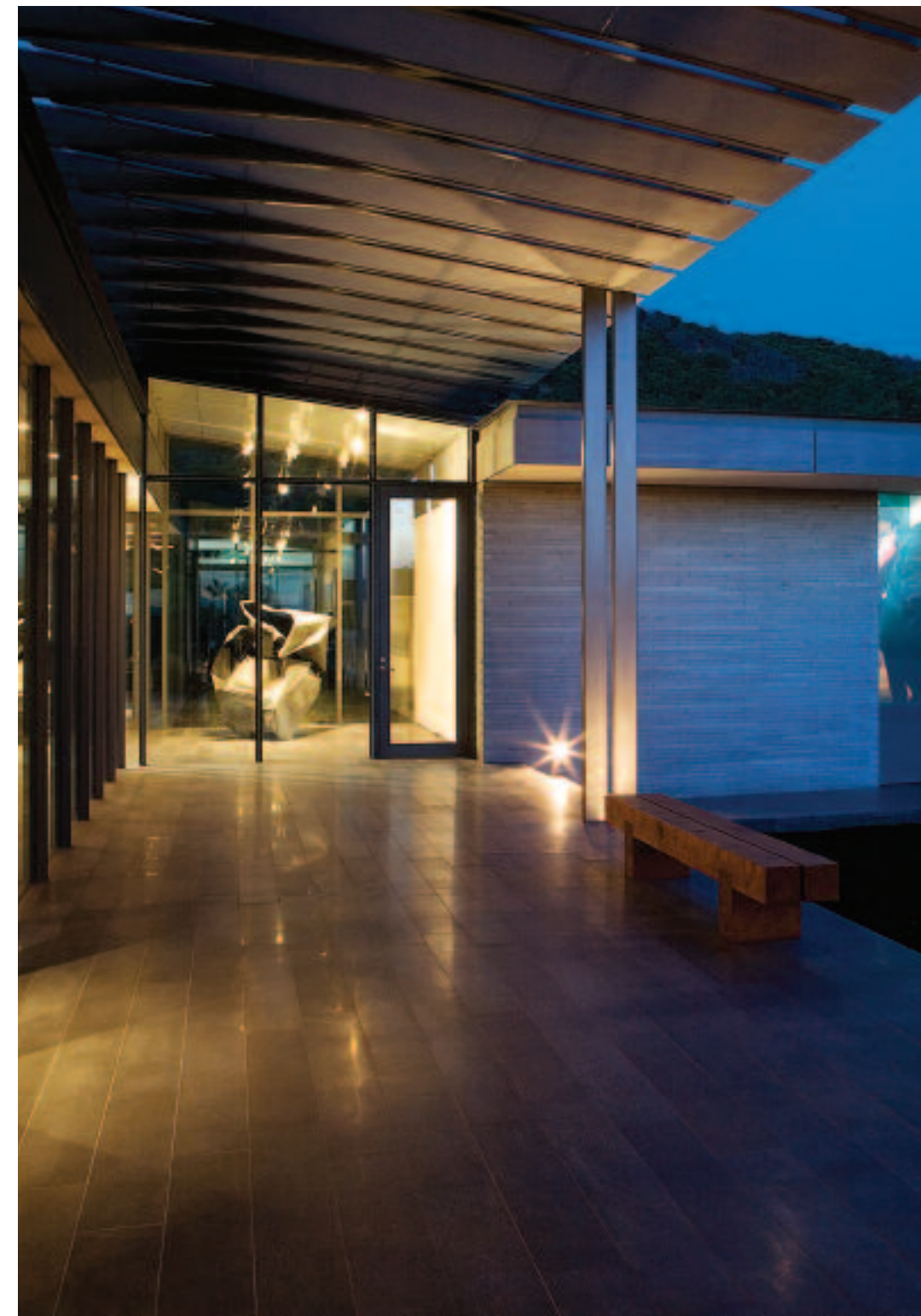
The gallery hall houses Ed Ruscha's acrylic on canvas, Futures (left). The walls are of unpunctured concrete, which makes hanging art a challenge. In the entryway sits Lilith Half Moon , an industrial-strength sculpture constructed of air-conditioning vents by John Chamberlain (right). The floor stone, Basaltina, from a quarry outside Rome, looks the same inside and out and is slip-resistant.